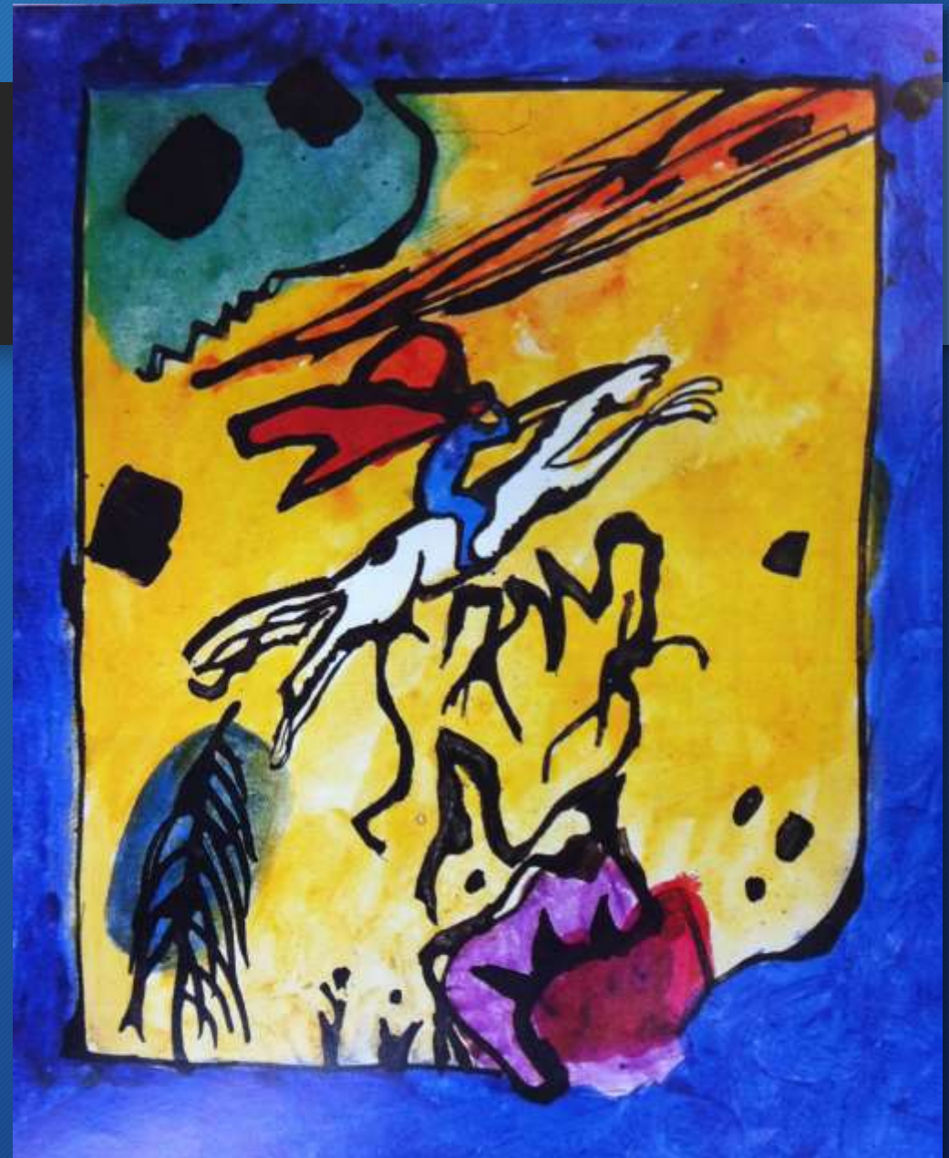
Vasilij Kandinskij, copertina del Blaue Reiter, 1911, Collezione privata

The Blaue Reiter artists are convinced that every artist must make a kind of "purifying journey" to rediscover the expressiveness of the first childhood scribbles, in which the image reflects emotions.